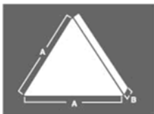
Straight Cut Triangle